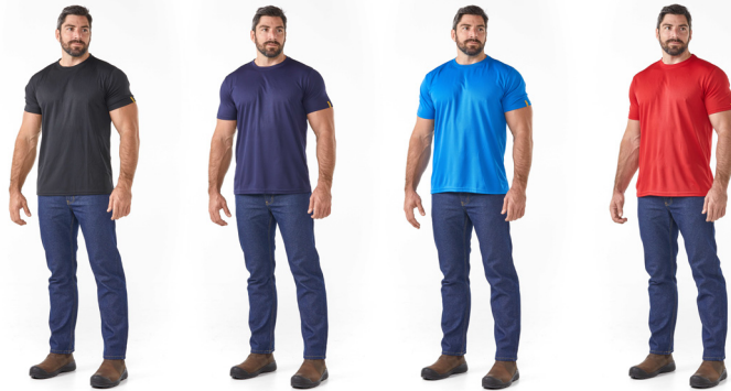
DW-TECH-TBK DW-TECH-TNB DW-TECH-TRB DW-TECH-TRD

Style: Crew neck, short sleeve t-shirt Fabric composition: 100% Polyester Mass: 140gsm