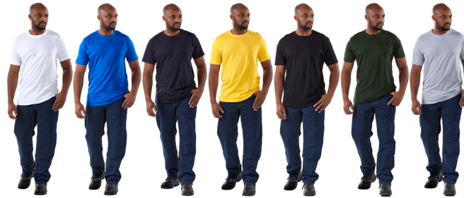
DW-TSHIRTWHT DW-TSHIRTRB DW-TSHIRTNB DW-TSHIRTYL DW-TSHIRTBK DW-TSHIRTBG DW-TSHIRTGY

Style: Round neck, short sleeve t-shirt. Fabric composition: 100% Combed cotton (Colour Tees). 88% Cotton/12% Polyester (Grey melange). Mass: 165gsm.